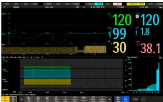
Car seat testing, recommended by the American Academy of Pediatrics, helps clinicians to assess neonates' ability to safely tolerate the car trip home.