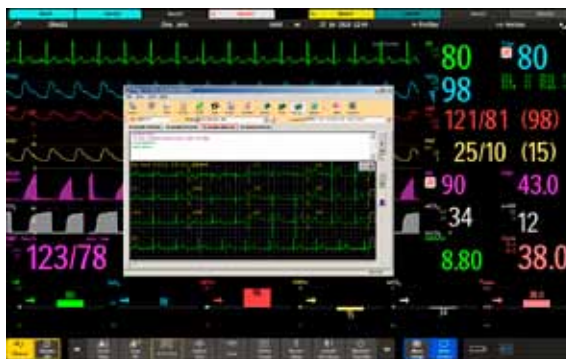
Access previous ECGs from Philips TraceMasterVue or other ECG management systems.