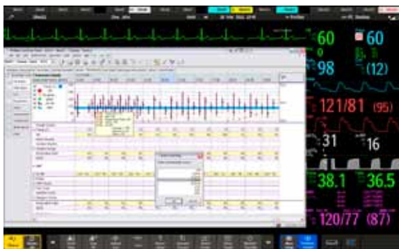
Show patient flow sheet from critical care information system (Philips ICIP).