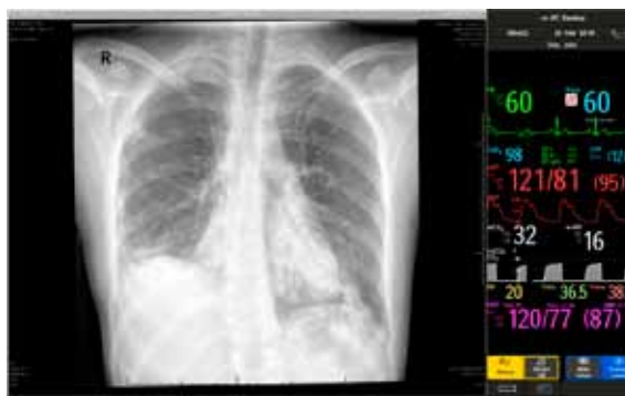
Leverage relevant information from your PACS.